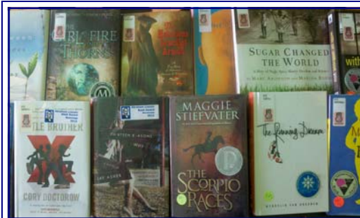
A selection of young adult books available in the BTC.

Many of the BTC's programs are led by student interns, providing them with valuable real world experience.